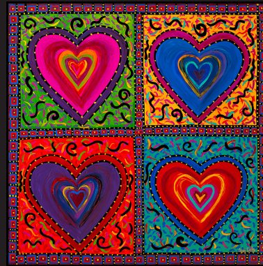
Love Quilt #2

Located directly across the King Kamehameha Hotel and Kailua Kona Pier